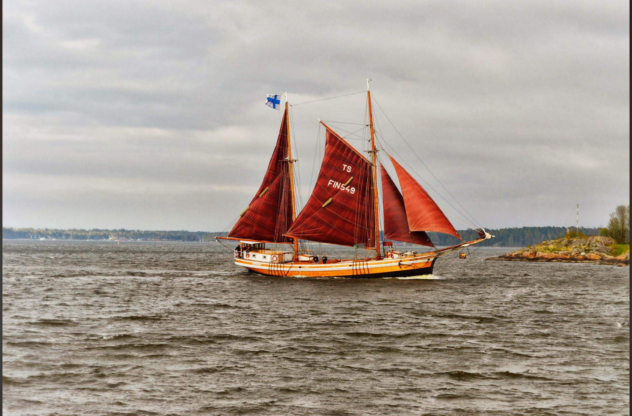
Suomenlinna Island, Finland