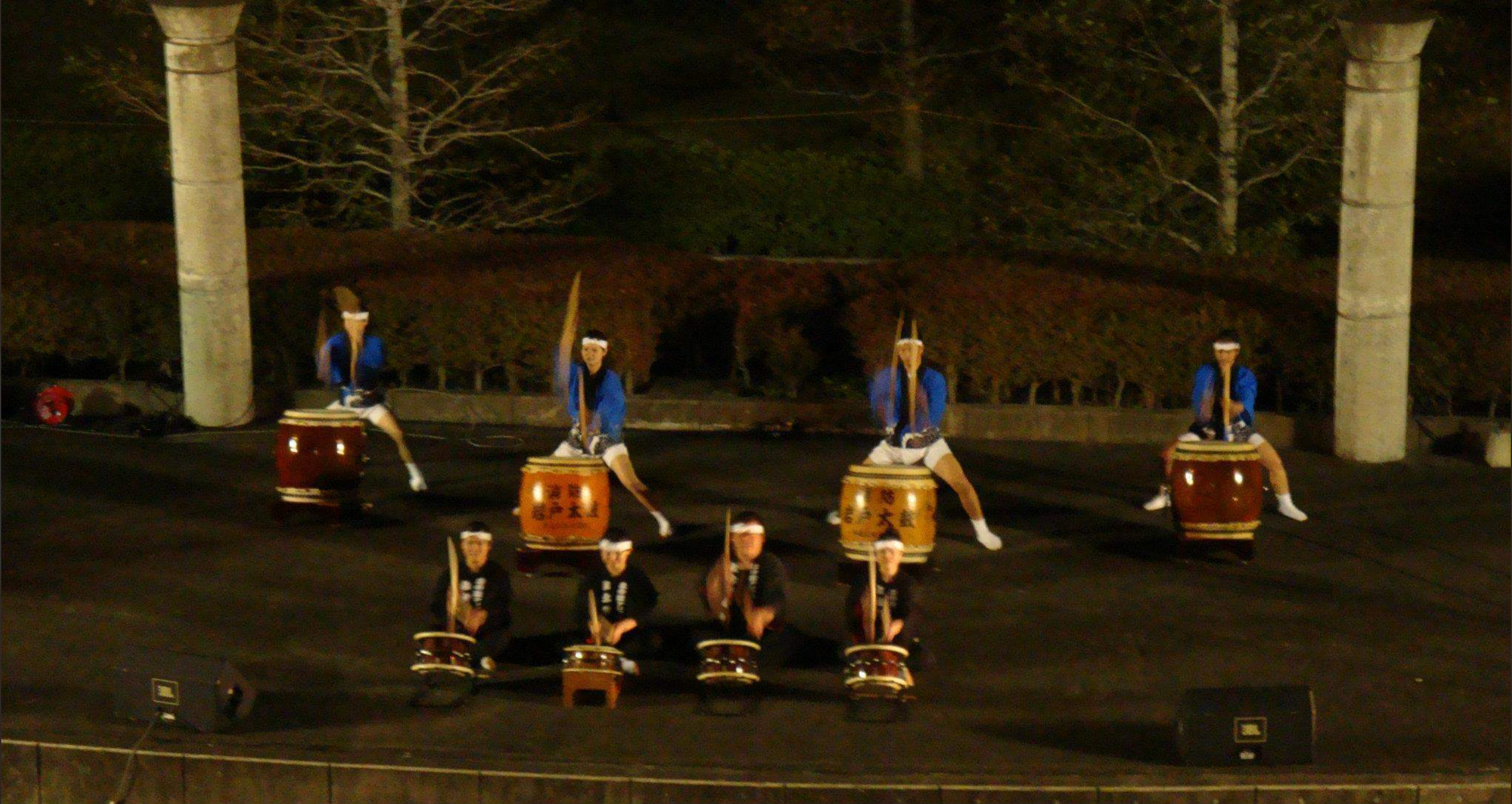
Cultural event, Beppu, Japan