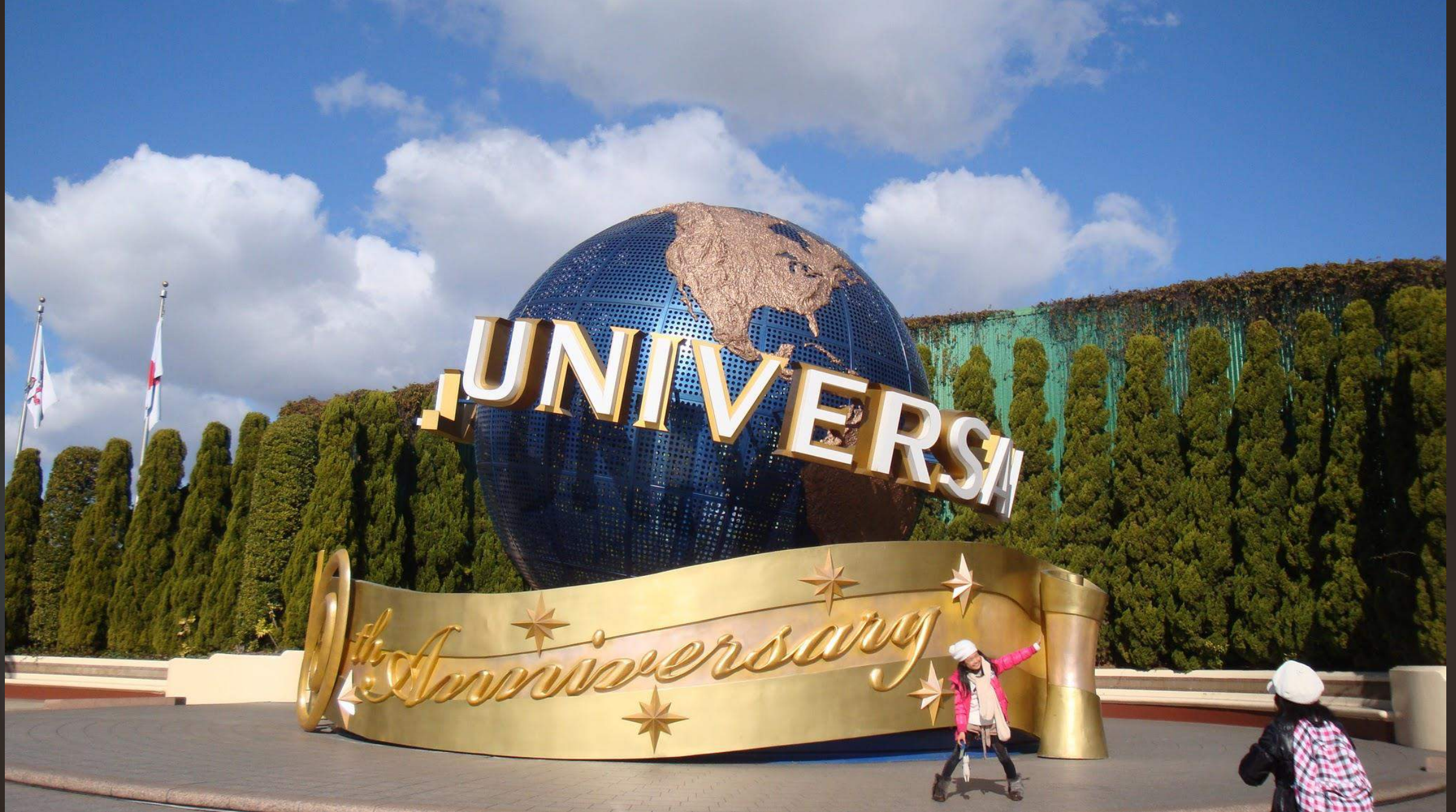
Universal Studios, Osaka, Japan