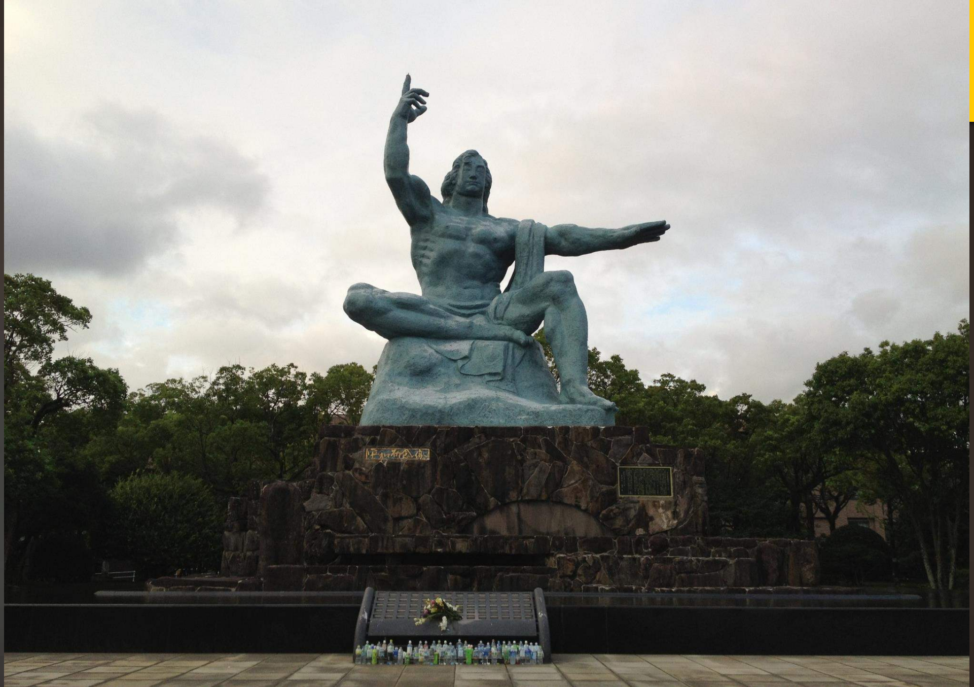
Peace Park, Nagasaki, Japan