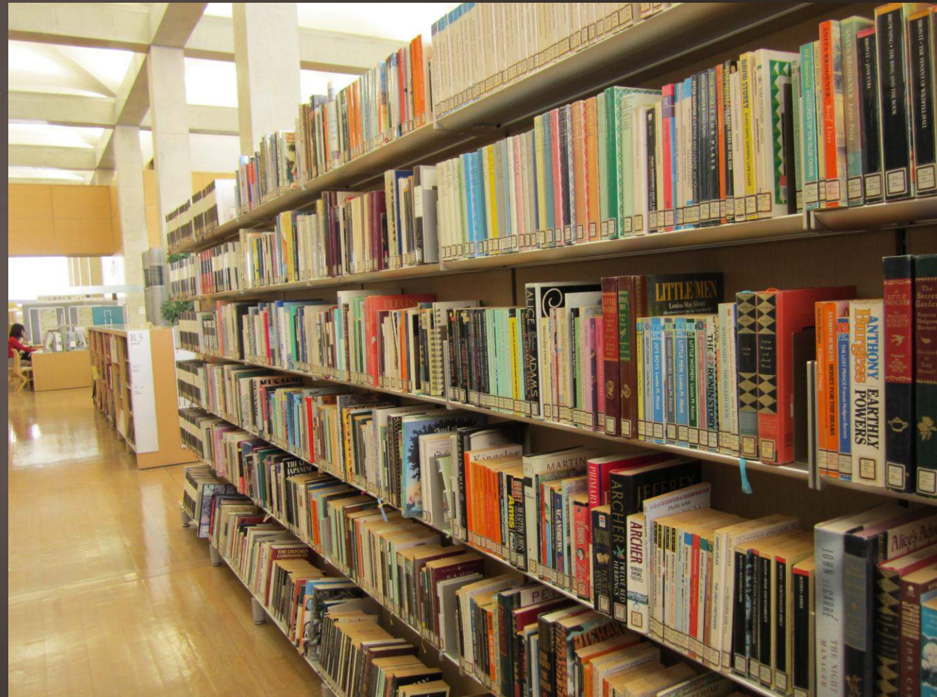
Public Library, Oita, Japan