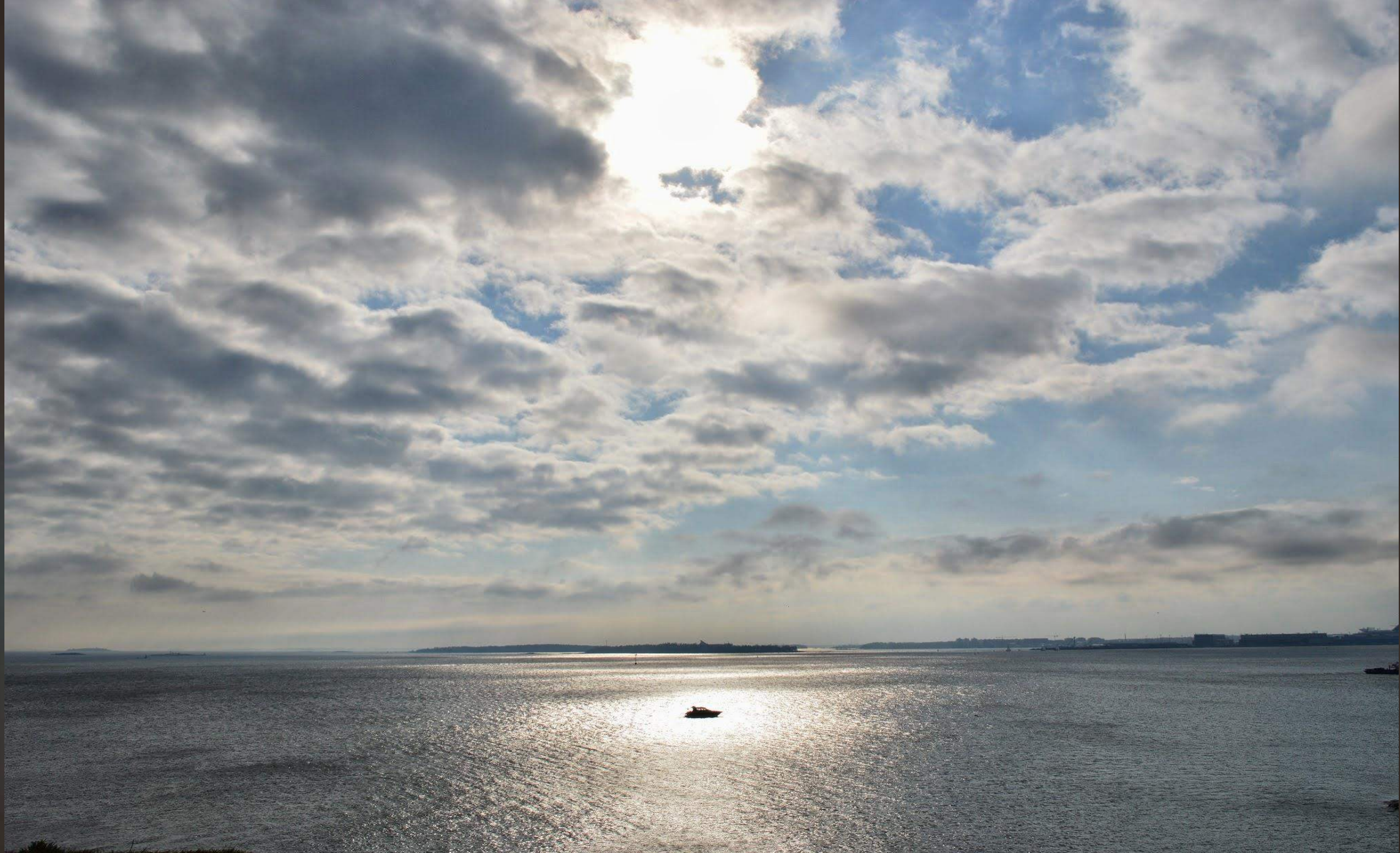
Suomenlinna Island, Finland