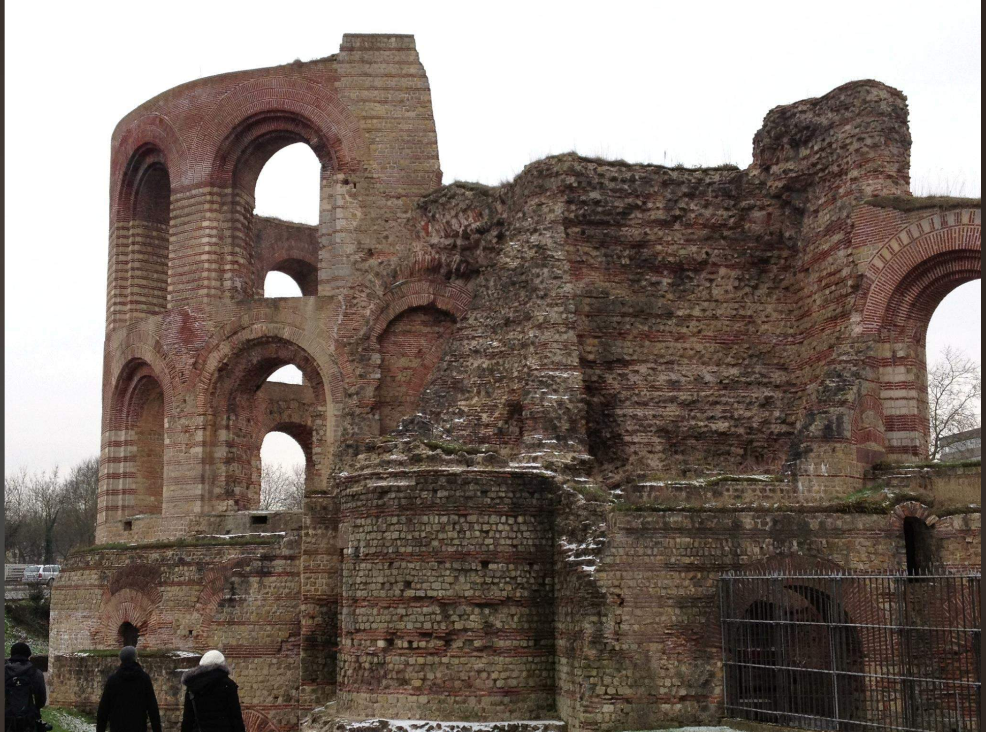
Imperial Baths, Trier, Germany